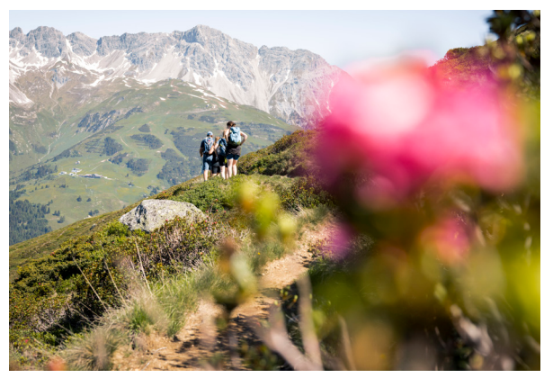
the perfect backdrop for all sports