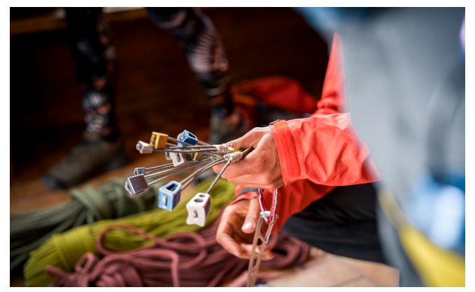
courses with expert knowledge