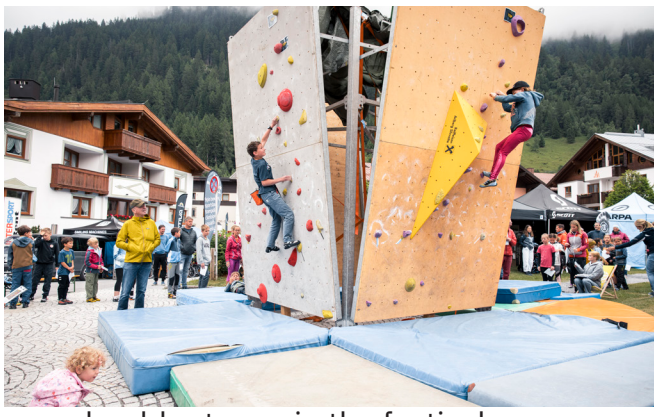
boulder tower in the festival area