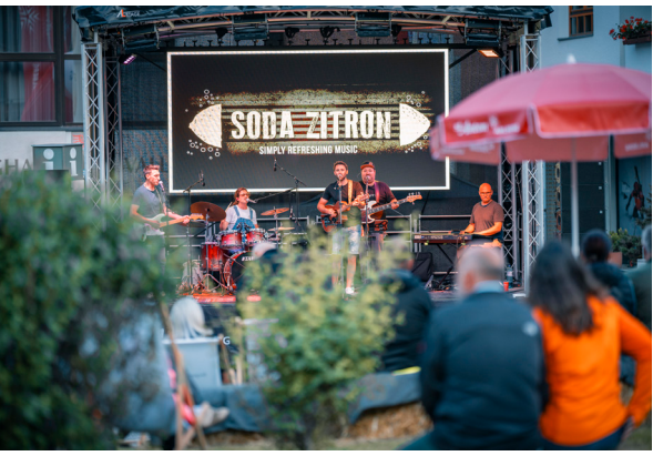
program on stage and live music